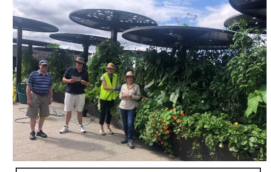
Arboretum Volunteers look after the flourishing kitchen garden. Below - a fabulous Bonsai collection.

Canerra was ablaze with the crepe myrtles featured below in the arboretum, and decorated many local streets to colourful effect.