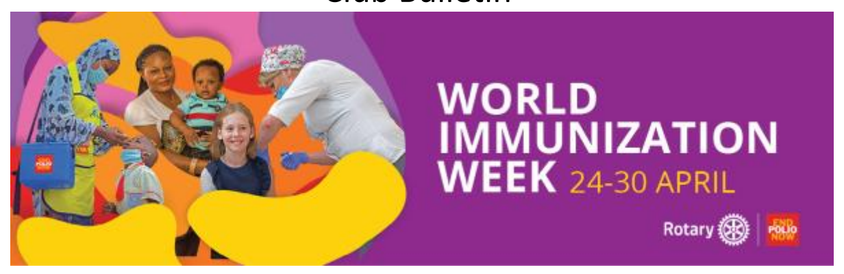
World Immunization Week 2024 Visit endpolio.org

World Immunization Week — 24-30 April — is a perfect opportunity for Rotary clubs to share the incredible progress we've made toward eradicating polio.