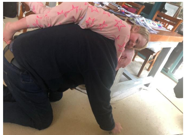
The things 3 year-olds do to their grandparents!