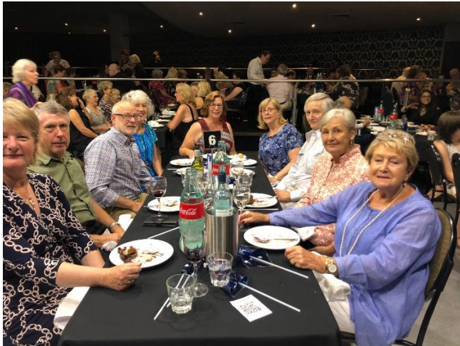
Left - Team of volunteers from the Warrandyte Neighbourhood House